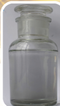
Lubricant Additive Component-Antifoam Antifoaming Additive Methyl Silicon Oil