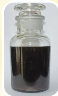
Detergency - Super over based synthetic calcium sulfonate TBN BOOSTER 400.