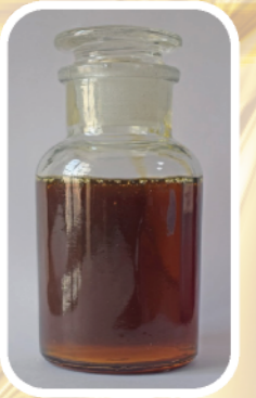
Engine Oil Additive SHAMAPRENE 9325G

ENGINE OIL ADDITIVE SHAMAPRENE 9325G (API SL /CF) ENGINE OIL ADDITIVE SHAMAPRENE 3080 (API SM/SN) ENGINE OIL ADITIVE SHAMAPRENE 3161 (API CI-4/SL) MULTIFUNCTIONAL ENGINE OIL ADDITIVE SHAMAPRENE 9111(API CK-4/SN) HEAVY DUTY DIESEL ENGINE OIL ADDITIVE SHAMAPRENE 12200 (API CH-4/CI4) 4T MOTORCYCLE ENGINE OIL ADDITIVE FB,FC 2T MOTOR ADDITIVE PACKAGE STEAM TURBINE OIL ADDITIVE PACKAGE AIR COMPRESSOR OIL ADDITIVE PACKAGE GEAR OIL ADDITIVE (LOW SMELL) LOW ZINC ANTIWEAR HYDRAULIC OIL ADDITIVE ATF ADDITIVE PACKAGE SUPER CONCENTRATE ENGINE COOLANT ADDITIVE PACKAGE