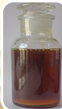
Lubricant Additive Component Dispersant