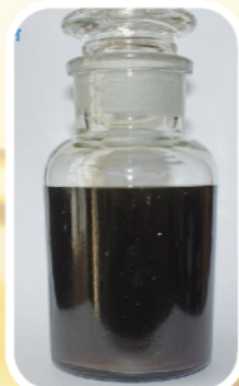
Lubricant Additive Component Dispersant