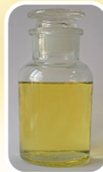
Pour point Depressant PPD