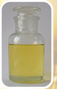
Gear oil additive